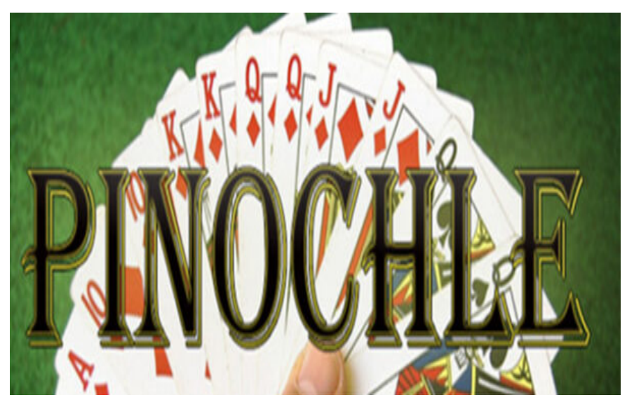
Thursday, May 22, 1:30 PM Sign-up sheet on table outside office

2025 CONCERT SPONSORS: Forms are available on the table across from the church office for you to sponsor this year's concert series.