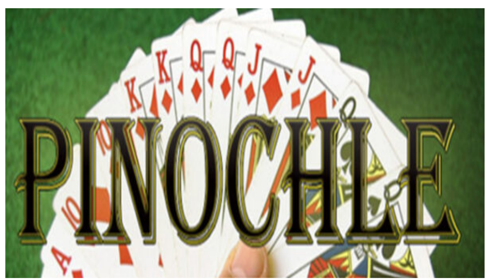
March 27, 1:00 PM Sign-up sheet on table outside office