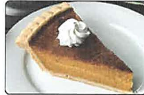
Pumpkin Pie 10" pumpkin pie made from our own homegrown pumpkins