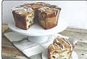
Apple Cake 52 oz. cake made from locally grown apples