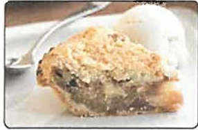
Apple Crumb Pie 10" apple pie with crumb topping and locally grown apples

Our fundraisers are designed to support your success, with a variety of homemade, high-quality baked goods - many made from fresh, local ingredients. You can feel good about selling them, and they're specially priced so you can raise funds for your organization.