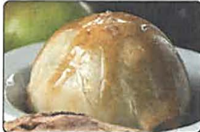
Apple Dumplings Pack of 2 apple dumplings made from locally grown apples