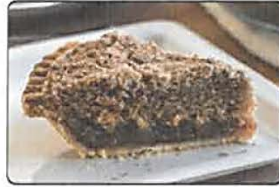
Shoofly Pie 10" shoofly pie made from Grandma Smucker's famous recipe