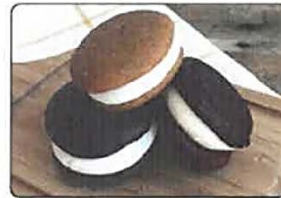
Mini Whoopie Pies Pack of 12 either Original or Variety (original, red velvet & pumpkin)