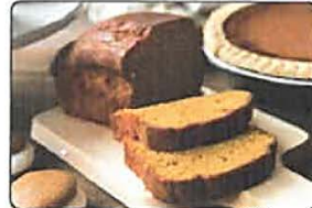
Pumpkin Bread 20 oz. loaf made from our own homegrown pumpkins