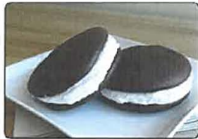
Whoopie Pies Pack of 6 chocolate whoopie pies with white filling