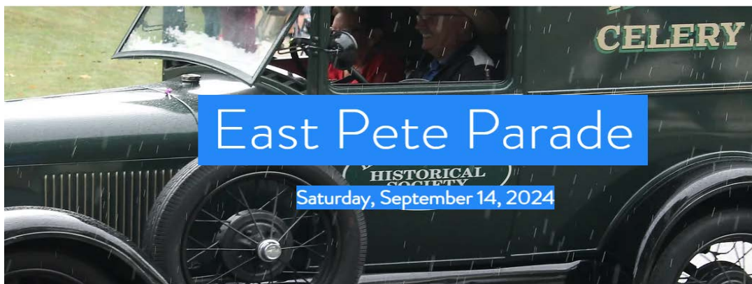
East Petersburg Parade